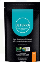
Medication Disposal Kits