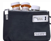
Locking Medication Pouches